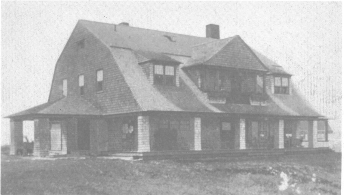
First Club House - 1902