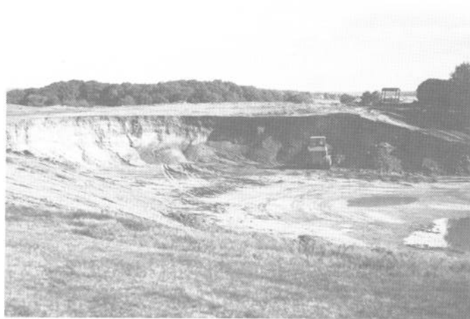
Excavation of 8th Hole & 2nd Fairway

It is difficult to imagine what the condition of FRCC would now be, (perhaps it would not be), had those very unpopular steps not been taken.