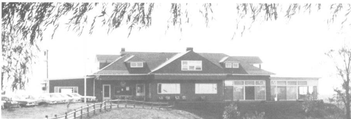
2nd Club House with Lounge & New River Room - Circa 1975