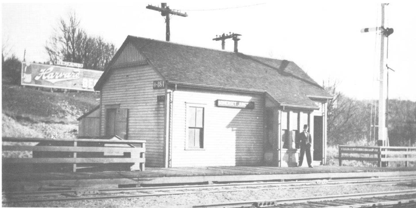
Somerset Junction Station, on the Old Colony Line, which was adjacent to the FRGC in 1900. The Old Colony RR ran from Newport & Fall River to Taunton & Boston via Somerset, and crossed the Taunton River to Somerset, just north of FRGC, over one of the longest causeways and bridges in New England. The line was discontinued in 1932.