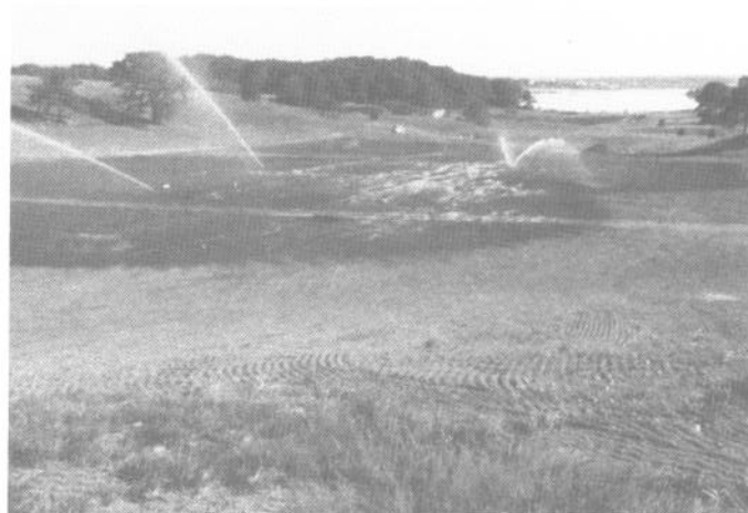
Re-seeding 2nd Fairway