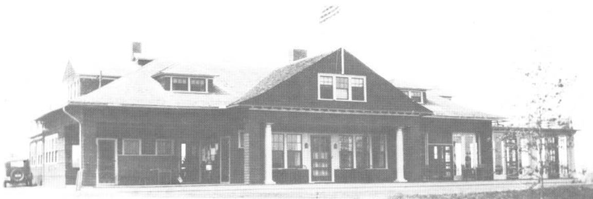
2nd Club House - Built 1910

It will not be possible to rebuild this season. The lease of the land occupied by the links runs out this year, and the executive committee will not make any decision relative to rebuilding until it is decided whether the lease is to be renewed, or a location for the links secured elsewhere.